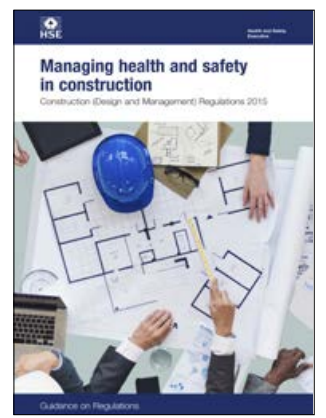
L153 Published 2015

The Construction (Design and Management) Regulations 2015 (CDM 2015) came into force on 6 April 2015, replacing CDM 2007. This publication provides guidance on the legal requirements for CDM 2015 and is available to help anyone with duties under the Regulations. It describes: